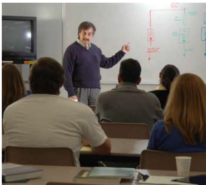
Training seminars will be part of the support services offered by the City.

Another benefit of becoming a recycled water customer is the dependability of the recycled water supply throughout the year. This is good news because as a recycled water user, you will be able to enjoy lush, healthy landscaping, even when others are forced to cut back due to requests for conservation or drought conditions.