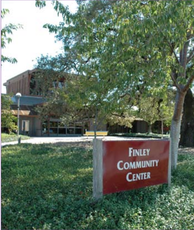
Among other places in Santa Rosa, recycled water is used at Finley Community Center for landscape irrigation purposes.