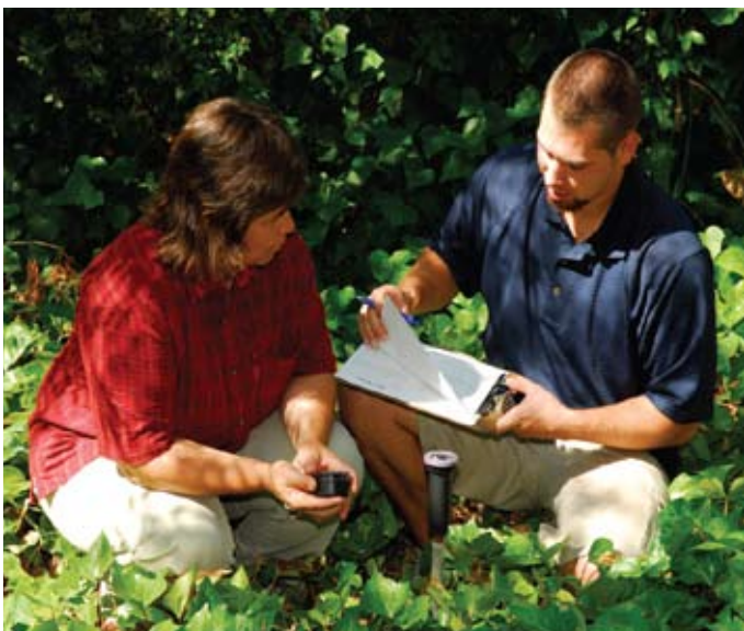
The Recycled Water Program team will carefully review and consider the best approach for your site.

“Choosing recycled water ... sends a message to the larger community that you are doing your part to help Santa Rosa meet its water supply objectives.”