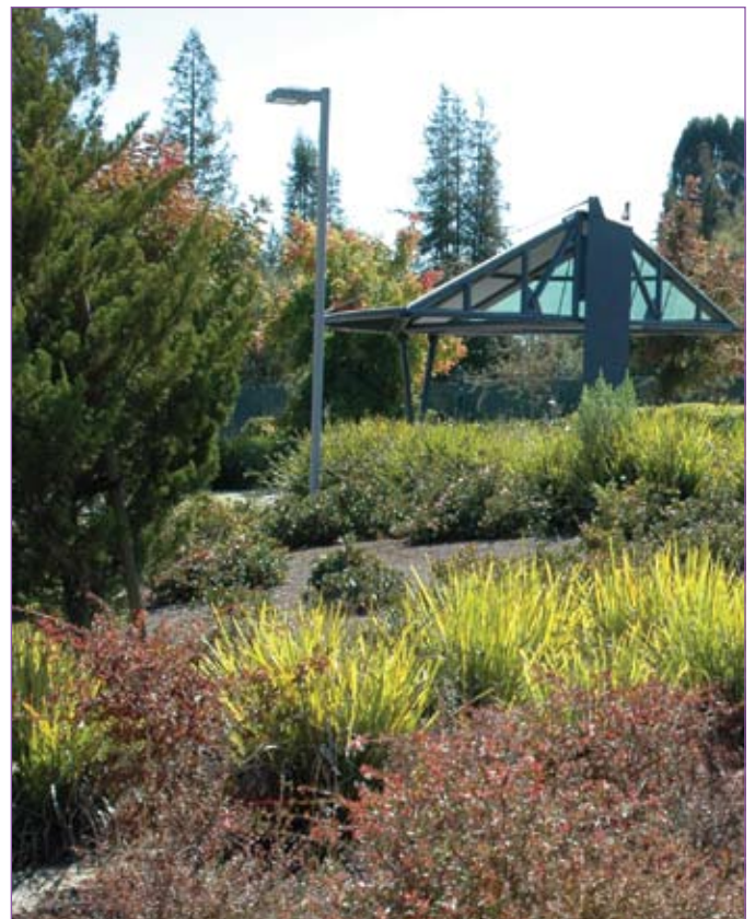
Maintain a lush landscape with recycled water.