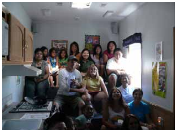
COPE participants have fun at neighborhood preparedness fairs

The City of Santa Rosa won an Award for Excellence in the Public Safety category of the 2007 Helen Putnam Award for Excellence program. COPE was also awarded the Sonoma County "Pete Peterka Award" for Excellence in Emergency Management. For more information, visit www.cacities.org/helenputnam and cope.srcity.org