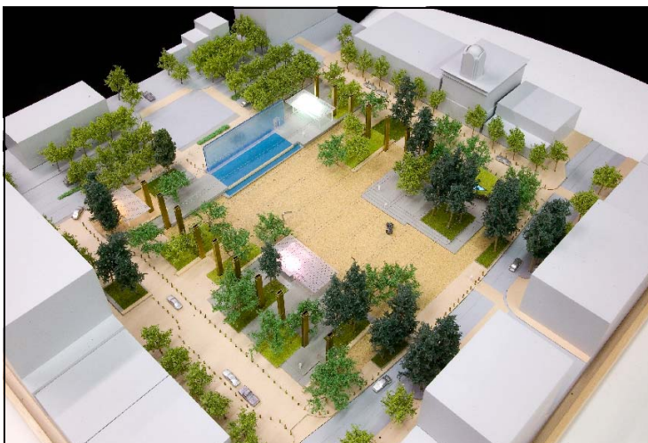
SWA Group Vision of the reunification of Courthouse Square.

is the focal point of Downtown. Its landscaped spaces and plaza areas provide for a range of activities, performances, and entertainment right in the heart of Downtown. It attracts business activity and patrons, retail facilities and shoppers, and performers and audiences. It is a distinctive place that residents can take pride in identifying as center of their hometown.” With this statement in mind, the Jury selected the SWA Group as the winner. Their design reinstates streets on the east and west sides of the square, creating parking and traffic flow around the central plaza. It includes a see through water wall and an arbor for overhead lights. It is anchored by activity pavilions on each corner. For more information visit www.srcity.org