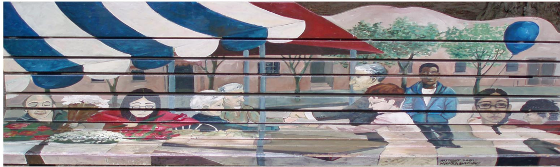
SANTA ROSA, CALIFORNIA